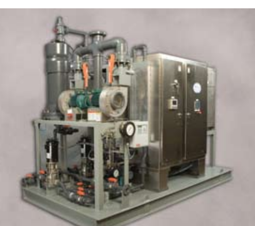
Severn Trent DeNora BalPure 1000 skid mounted unit.