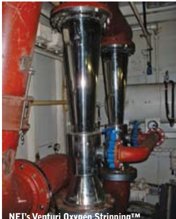
NEI's Venturi Oxygen Stripping™ ballast water treatment system.